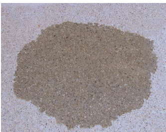
Mortar not repellent.

Should apply 2-3 coats depending on the porosity of the material.